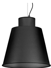
04: RAL 7016 Anthracite Grey