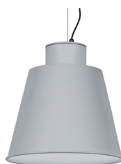
07: RAL 9006 White Aluminium textured