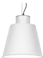
01: RAL 9010 Pure White textured