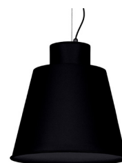
02: RAL 9005 Jet Black textured