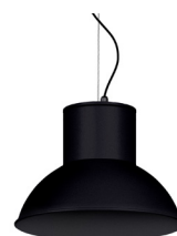
02: RAL 9005 Jet Black textured