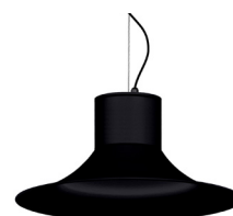
02: RAL 9005 Jet Black textured