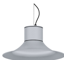
07: RAL 9006 White Aluminium textured