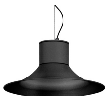
04: RAL 7016 Anthracite Grey