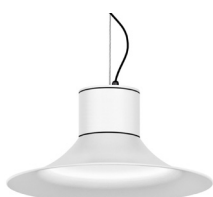
01: RAL 9010 Pure White textured