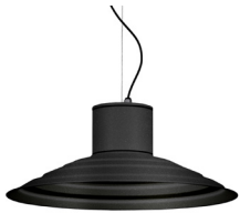
04: RAL 7016 Anthracite Grey