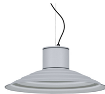
07: RAL 9006 White Aluminium textured