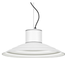
01: RAL 9010 Pure White textured