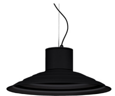
02: RAL 9005 Jet Black textured