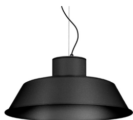
04: RAL 7016 Anthracite Grey