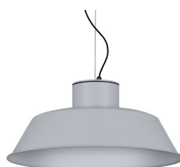
07: RAL 9006 White Aluminium textured