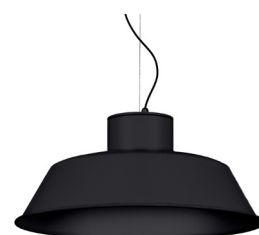
02: RAL 9005 Jet Black textured