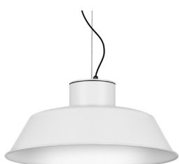
01: RAL 9010 Pure White textured