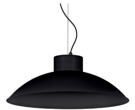
02: RAL 9005 Jet Black textured