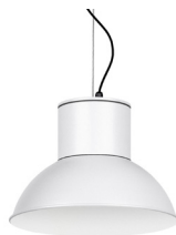
01: RAL 9010 Pure White textured