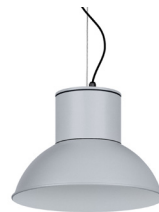
07: RAL 9006 White Aluminium textured