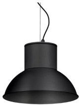
04: RAL 7016 Anthracite Grey