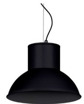
02: RAL 9005 Jet Black textured