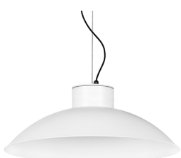
01: RAL 9010 Pure White textured