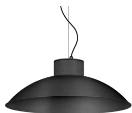
04: RAL 7016 Anthracite Grey