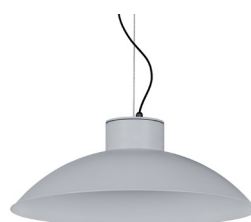
07: RAL 9006 White Aluminium textured