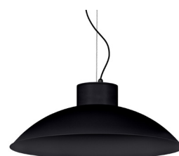
02: RAL 9005 Jet Black textured