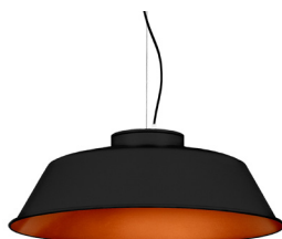
2: RAL9005 Jet Black textured 40: Copper