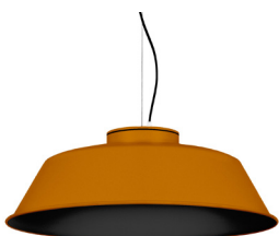
21: RAL 8001: Ochre Brown textured 20: RAL9005 Jet Black textured