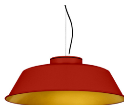
16: RAL 3000 Flame red textured 30: Golden