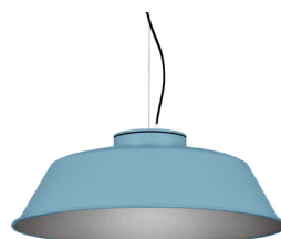
17: RAL 5024 Pastel Blue textured 50: Silvered