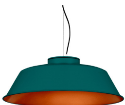
20: RAL 6000 Patina Green textured 40: Copper