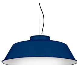
18: RAL 5003 Sapphire Blue textured 10: RAL9010 Pure White textured