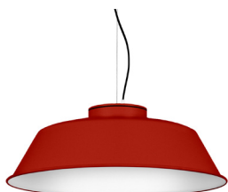
16: RAL 3000 Flame red textured 10: RAL9010 Pure White textured