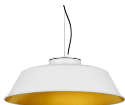
1: RAL9010 Pure White textured 30: Golden