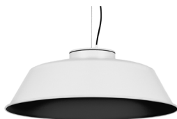
20: RAL9005 Jet Black