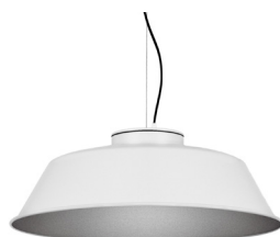
2: RAL9005 Jet Black textured 50: Silvered