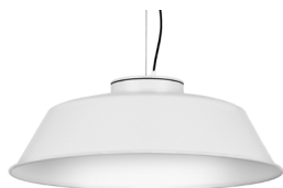
10: RAL 9010 Pure White