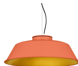
15: RAL 2012 Salmon Orange textured 30: Golden