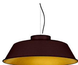
22: RAL8016 Mahogany Brown textured 30: Golden