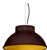
22: RAL8016 Mahogany Brown textured 30: Golden