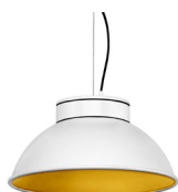
1: RAL9010 Pure White textured 30: Golden