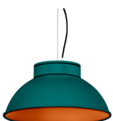
20: RAL 6000 Patina Green textured 40: Copper