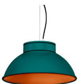
20: RAL 6000 Patina Green textured 40: Copper