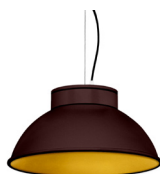
22: RAL8016 Mahogany Brown textured 30: Golden