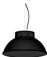
2: RAL9005 Jet Black textured