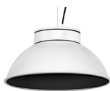
20: RAL9005 Jet Black