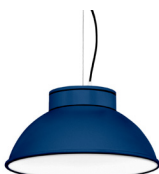
18: RAL 5003 Sapphire Blue textured 10: RAL9010 Pure White textured