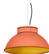
15: RAL 2012 Salmon Orange textured 30: Golden