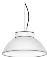
1: RAL9010 Pure White textured