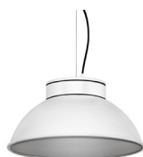
2: RAL9005 Jet Black textured 50: Silvered