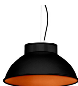
2: RAL9005 Jet Black textured 40: Copper