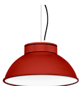
16: RAL 3000 Flame red textured 10: RAL9010 Pure White textured