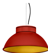
16: RAL 3000 Flame red textured 30: Golden