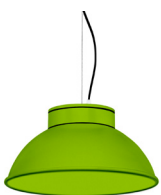
19: RAL 6018 Yellow Green textured