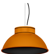
21: RAL 8001: Ochre Brown textured 20: RAL9005 Jet Black textured