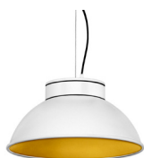
1: RAL9010 Pure White textured 30: Golden