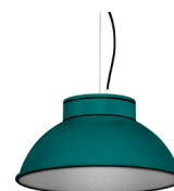
20: RAL 6000 Patina Green textured 50: Silvered