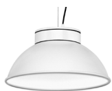
10: RAL 9010 Pure White