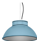
17: RAL 5024 Pastel Blue textured 50: Silvered