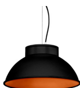
2: RAL9005 Jet Black textured 40: Copper