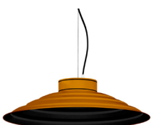
21: RAL 8001: Ochre Brown textured 20: RAL9005 Jet Black textured