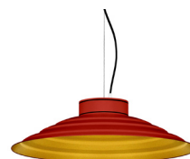
16: RAL 3000 Flame red textured 30: Golden