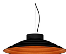
2: RAL9005 Jet Black textured 40: Copper