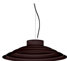
22: RAL8016 Mahogany Brown textured