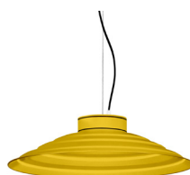
13: RAL 1023 Traffic Yellow textured