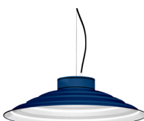
18: RAL 5003 Sapphire Blue textured 10: RAL9010 Pure White textured