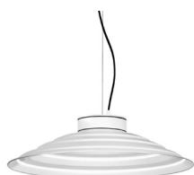
1: RAL9010 Pure White textured