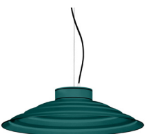
20: RAL 6000 Patina Green textured