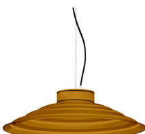
21: RAL 8001: Ochre Brown textured