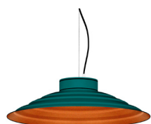
20: RAL 6000 Patina Green textured 40: Copper