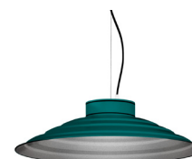
20: RAL 6000 Patina Green textured 50: Silvered