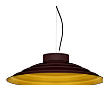
22: RAL8016 Mahogany Brown textured 30: Golden