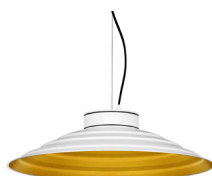
1: RAL9010 Pure White textured 30: Golden