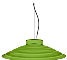
19: RAL 6018 Yellow Green textured