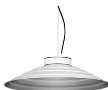
2: RAL9005 Jet Black textured 50: Silvered