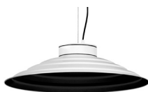
20: RAL9005 Jet Black