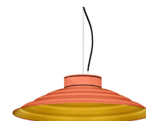
15: RAL 2012 Salmon Orange textured 30: Golden