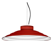
16: RAL 3000 Flame red textured 10: RAL9010 Pure White textured