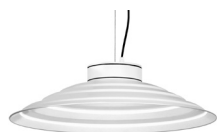
10: RAL 9010 Pure White