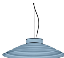
17: RAL 5024 Pastel Blue textured