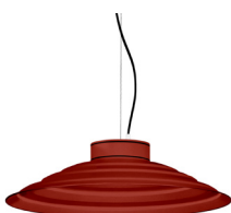
16: RAL 3000 Flame red textured