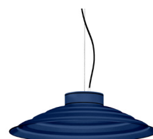
18: RAL 5003 Sapphire Blue textured