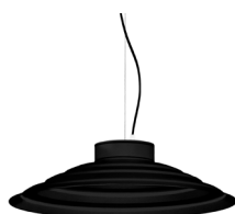
2: RAL9005 Jet Black textured