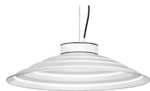
10: RAL 9010 Pure White