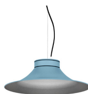
17: RAL 5024 Pastel Blue textured 50: Silvered