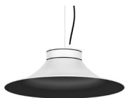
20: RAL9005 Jet Black