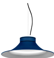
18: RAL 5003 Sapphire Blue textured 10: RAL9010 Pure White textured