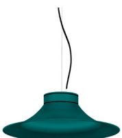
20: RAL 6000 Patina Green textured