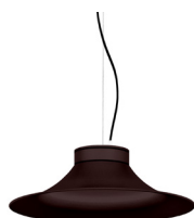
22: RAL8016 Mahogany Brown textured