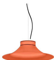
15: RAL 2012 Salmon Orange textured