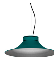
20: RAL 6000 Patina Green textured 50: Silvered