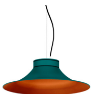
20: RAL 6000 Patina Green textured 40: Copper