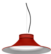
16: RAL 3000 Flame red textured 10: RAL9010 Pure White textured