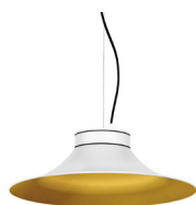
1: RAL9010 Pure White textured 30: Golden