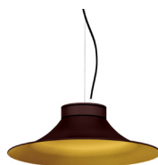
22: RAL8016 Mahogany Brown textured 30: Golden