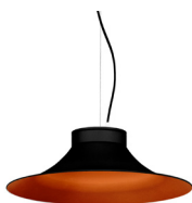
2: RAL9005 Jet Black textured 40: Copper