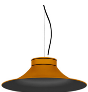
21: RAL 8001: Ochre Brown textured 20: RAL9005 Jet Black textured