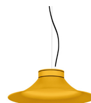
14: RAL 1037 Sun Yellow textured