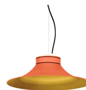
15: RAL 2012 Salmon Orange textured 30: Golden