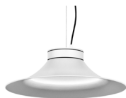
10: RAL 9010 Pure White