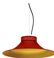
16: RAL 3000 Flame red textured 30: Golden