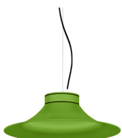
19: RAL 6018 Yellow Green textured