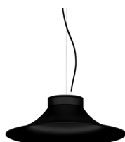
2: RAL9005 Jet Black textured