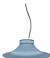
17: RAL 5024 Pastel Blue textured