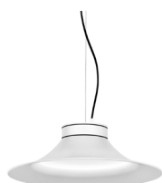
1: RAL9010 Pure White textured