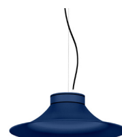
18: RAL 5003 Sapphire Blue textured