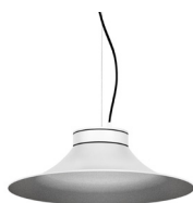
2: RAL9005 Jet Black textured 50: Silvered