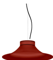
16: RAL 3000 Flame red textured