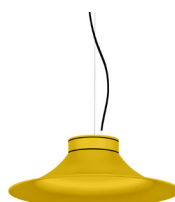
13: RAL 1023 Traffic Yellow textured