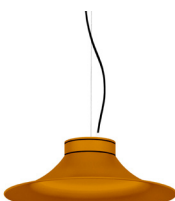
21: RAL 8001: Ochre Brown textured