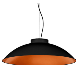
2: RAL9005 Jet Black textured 40: Copper