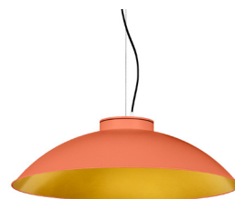
15: RAL 2012 Salmon Orange textured 30: Golden