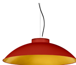
16: RAL 3000 Flame red textured 30: Golden