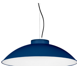
18: RAL 5003 Sapphire Blue textured 10: RAL9010 Pure White textured