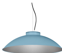
17: RAL 5024 Pastel Blue textured 50: Silvered