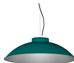
20: RAL 6000 Patina Green textured 50: Silvered