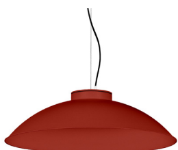
16: RAL 3000 Flame red textured