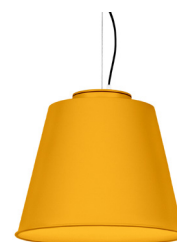
14: RAL 1037 Sun Yellow textured