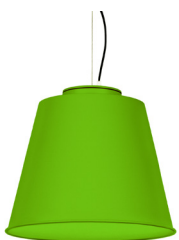
19: RAL 6018 Yellow Green textured