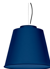
18: RAL 5003 Sapphire Blue textured