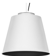
20: RAL9005 Jet Black