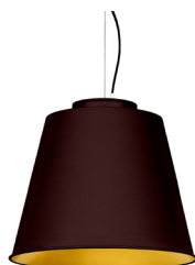
22: RAL8016 Mahogany Brown textured 30: Golden