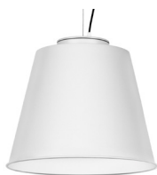
10: RAL 9010 Pure White