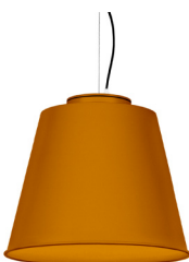
21: RAL 8001: Ochre Brown textured