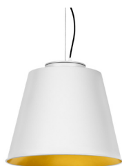
1: RAL9010 Pure White textured 30: Golden