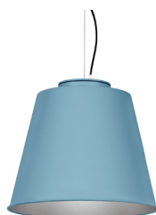
17: RAL 5024 Pastel Blue textured 50: Silvered