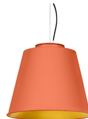
15: RAL 2012 Salmon Orange textured 30: Golden