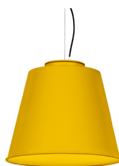
13: RAL 1023 Traffic Yellow textured