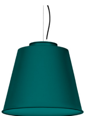
20: RAL 6000 Patina Green textured