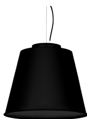
2: RAL9005 Jet Black textured