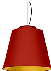
16: RAL 3000 Flame red textured 30: Golden