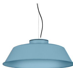
17: RAL 5024 Pastel Blue textured