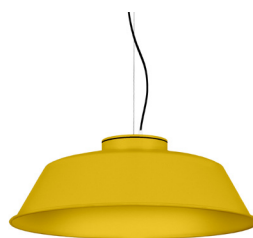
13: RAL 1023 Traffic Yellow textured