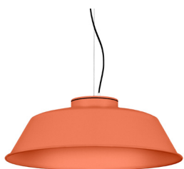
15: RAL 2012 Salmon Orange textured