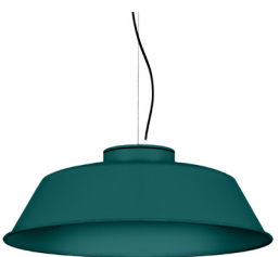
20: RAL 6000 Patina Green textured