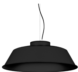
2: RAL9005 Jet Black textured