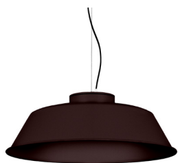
22: RAL8016 Mahogany Brown textured