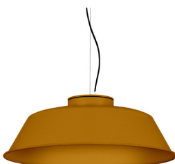
21: RAL 8001: Ochre Brown textured