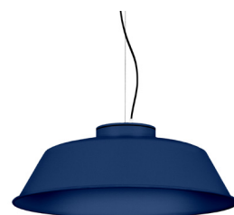
18: RAL 5003 Sapphire Blue textured