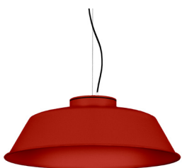
16: RAL 3000 Flame red textured