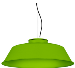
19: RAL 6018 Yellow Green textured