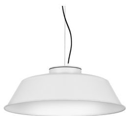
1: RAL9010 Pure White textured