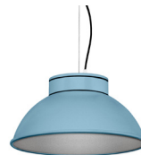
17: RAL 5024 Pastel Blue textured 50: Silvered