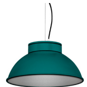
20: RAL 6000 Patina Green textured 50: Silvered