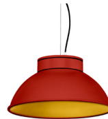
16: RAL 3000 Flame red textured 30: Golden