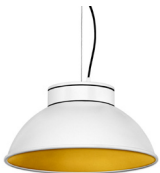
1: RAL9010 Pure White textured 30: Golden