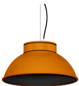
21: RAL 8001: Ochre Brown textured 20: RAL9005 Jet Black textured