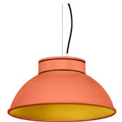
15: RAL 2012 Salmon Orange textured 30: Golden