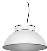
2: RAL9005 Jet Black textured 50: Silvered