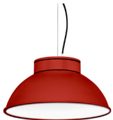
16: RAL 3000 Flame red textured 10: RAL9010 Pure White textured