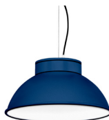
18: RAL 5003 Sapphire Blue textured 10: RAL9010 Pure White textured