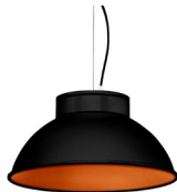
2: RAL9005 Jet Black textured 40: Copper