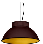
22: RAL8016 Mahogany Brown textured 30: Golden