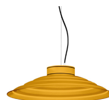
14: RAL 1037 Sun Yellow textured