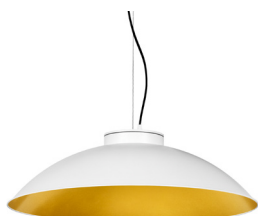
1: RAL9010 Pure White textured 30: Golden