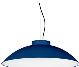
18: RAL 5003 Sapphire Blue textured 10: RAL9010 Pure White textured