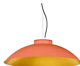
15: RAL 2012 Salmon Orange textured 30: Golden