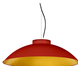
16: RAL 3000 Flame red textured 30: Golden