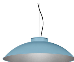
17: RAL 5024 Pastel Blue textured 50: Silvered