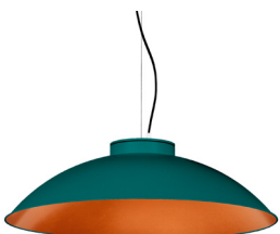
20: RAL 6000 Patina Green textured 40: Copper