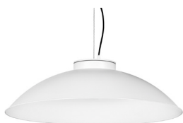
10: RAL 9010 Pure White