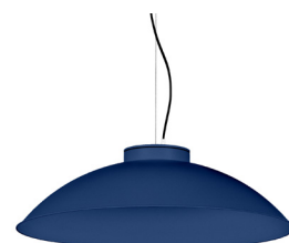
18: RAL 5003 Sapphire Blue textured