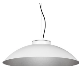
2: RAL9005 Jet Black textured 50: Silvered