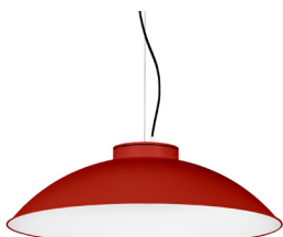
16: RAL 3000 Flame red textured 10: RAL9010 Pure White textured