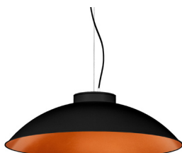
2: RAL9005 Jet Black textured 40: Copper