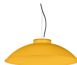
14: RAL 1037 Sun Yellow textured