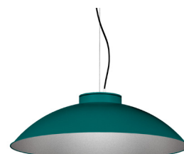
20: RAL 6000 Patina Green textured 50: Silvered