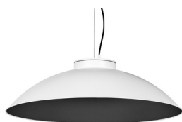
20: RAL9005 Jet Black