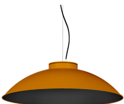
21: RAL 8001: Ochre Brown textured 20: RAL9005 Jet Black textured