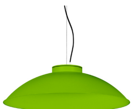
19: RAL 6018 Yellow Green textured