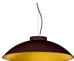
22: RAL8016 Mahogany Brown textured 30: Golden