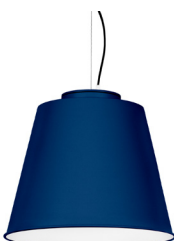
18: RAL 5003 Sapphire Blue textured 10: RAL9010 Pure White textured