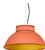
15: RAL 2012 Salmon Orange textured 30: Golden