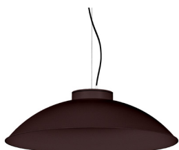
22: RAL8016 Mahogany Brown textured