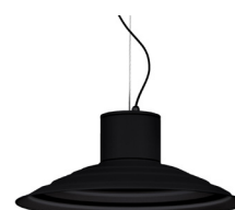
02: RAL 9005 Jet Black textured