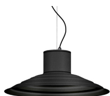
04: RAL 7016 Anthracite Grey