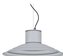
07: RAL 9006 White Aluminium textured