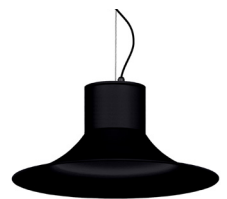
02: RAL 9005 Jet Black textured