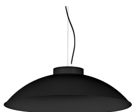
2: RAL9005 Jet Black textured