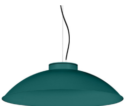
20: RAL 6000 Patina Green textured